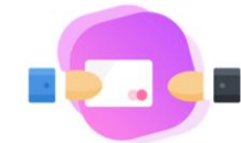
Company cards for employees