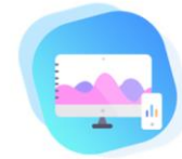
Real-time spending overview