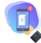
Automated expense reporting